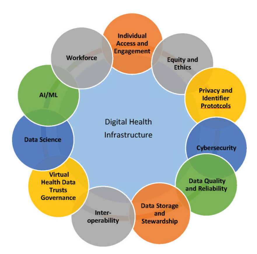
FIGURE 2 | Infrastructure Requirements for Progress in Digital Health